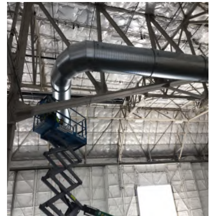
Pro Mechanical Services-HVAC

Plan A- $0.30 Plan B- $0.25 Extended Benefits $0.01