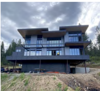
Custom house architectural project Carlson Sheet Metal- Spokane, WA