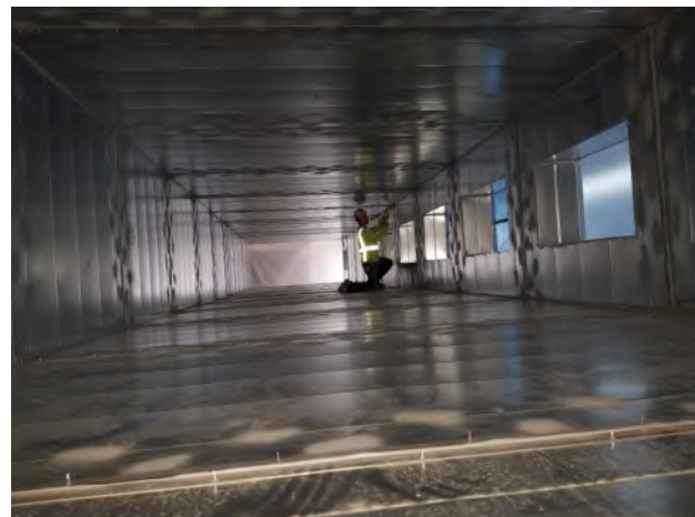
Inside Duct at Micron - YMC