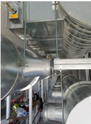
YMC Mechanical Boise, Idaho