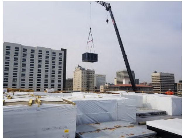
Apollo Mechanical at the INB in downtown Spokane